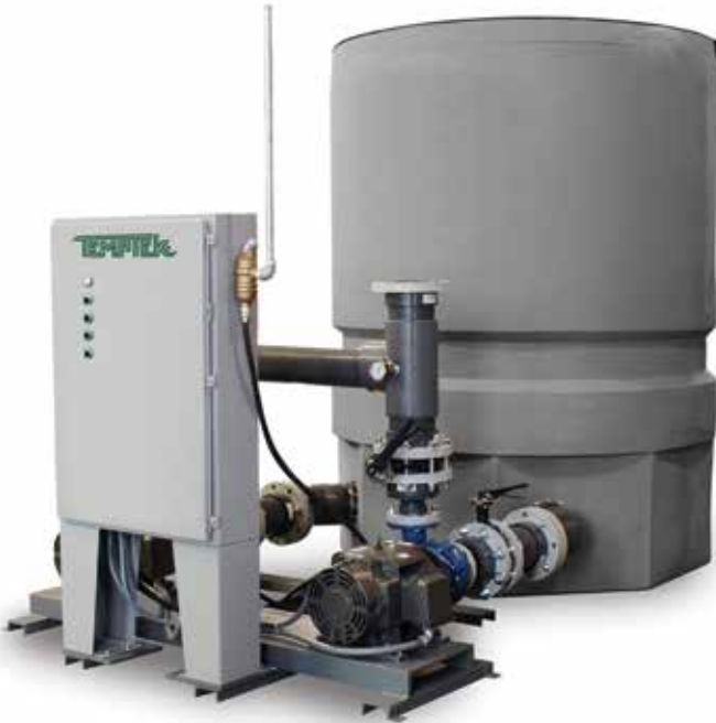
PPT-1500-3P shown with these optional features: • Standby pump and manifold • Central control console • Pressure and temperature alarms • Electric water make-up system